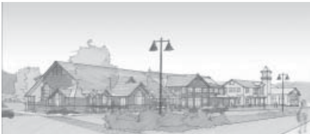
One possible design

Over the next nine months the Town of Tiburon will be preparing an initial study and an environmental impact report (EIR) for the Library expansion project. The report will study the feasibility of locating the expansion on the site of the existing parking lot. This location was chosen as the preferred site by the Belvedere-Tiburon Library Agency following a recommendation by a Building Committee comprised of local residents.